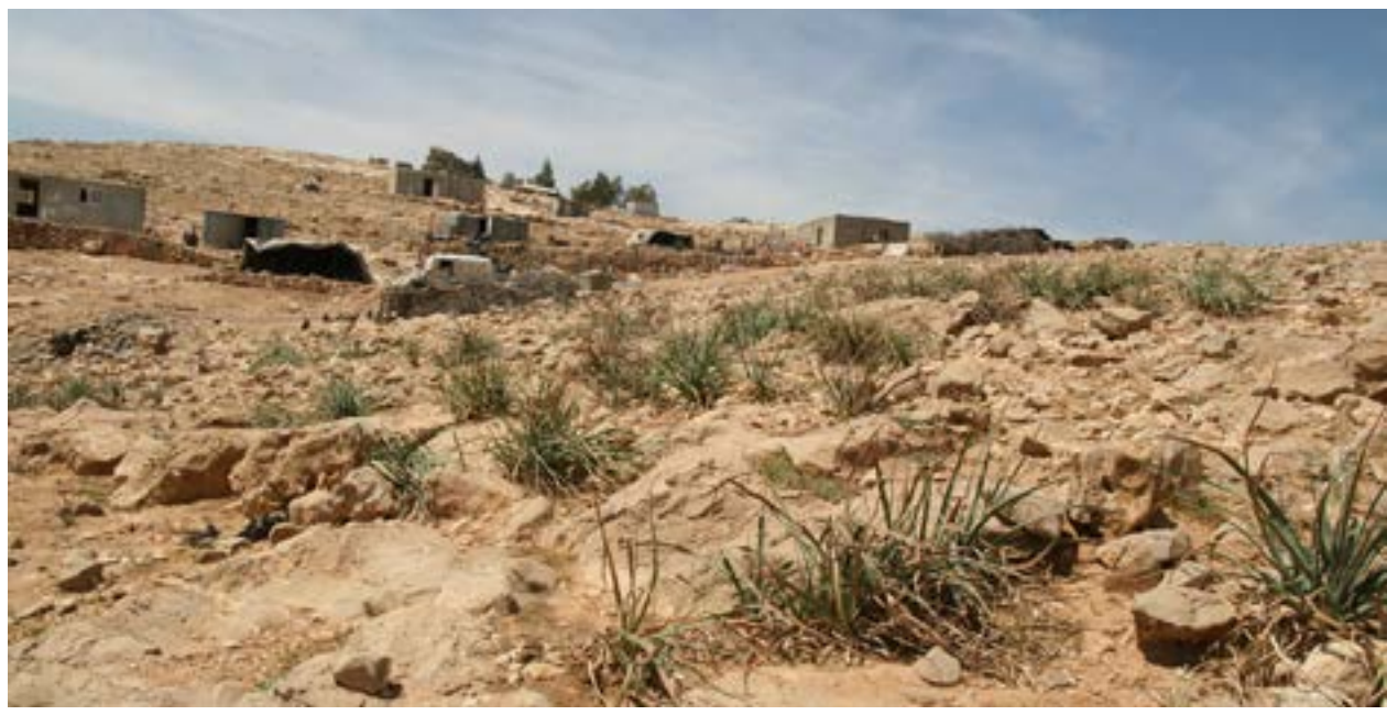
Two photos of Um al Kheir.