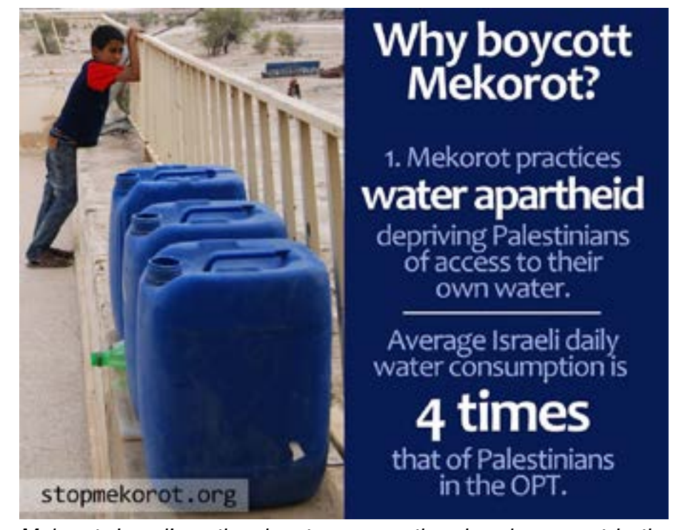
Mekorot, Israel's national water corporation, is a key agent in the ethnic cleansing of the Bedouin communities.