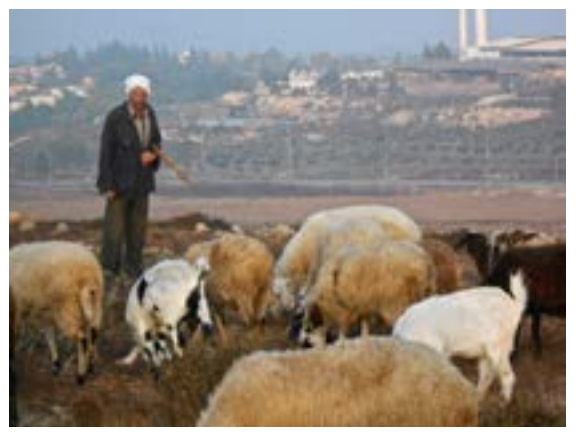
South Hebron hills, cose to the Susia settlement.

The people of Um al-Kheir hail from Jahalin Bedouin of Tel Arad. In 1948, Israeli forces expelled thousands from Tel Arad. Of the 22,000 that were expelled, some moved to the hills around Jerusalem, Bethlehem and Jericho. Others left the West Bank entirely, heading to