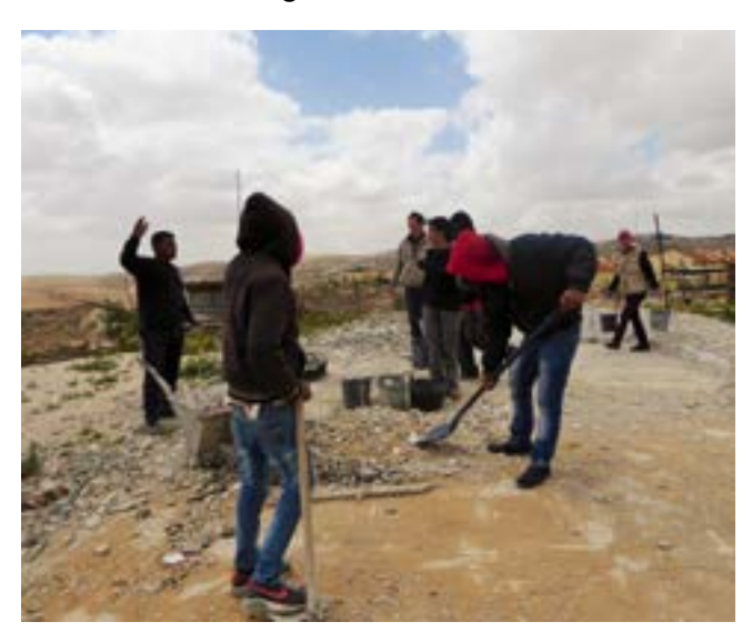
Youth in a day of volunteer work to clean up rubble of a demolished home in Um al Kheir.

A serious danger of exhaustion for everyone involved in the current state of affairs. The ability to buy time, ultimately, depends on the resilience of the community to withstand demolitions, to remain vigilant, to keep track of papers and orders, often in a language they do not understand, for years and years on end. It is a drain on resources, as expensive barracks are destroyed and animals are lost. Al-Hadidiya used to be home to 150 families. Today, only 14 families have been able to remain. For the lawyers it requires constant improvisation, and working in a system that is systematically discriminatory against Palestinians, and is constantly threatening to deny respite to Palestinians all together.