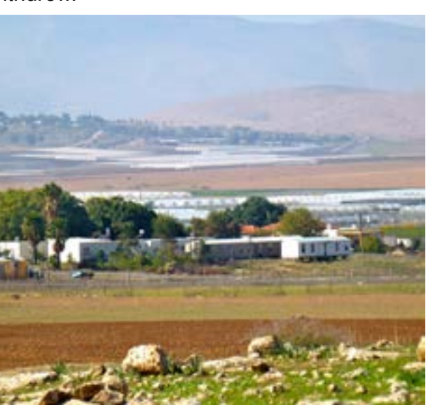
A photo of the illegal Israeli settlement of Roi and then the Palestinian village Al Hadidiya.

m al-Kheir is a small community of 125 people located in the south Hebron hills, east of the city of Yatta. Like al-Hadidiya, reaching the community requires driving along several dirt roads. The illegal Karmel settlement surrounds the community. The residential section of the