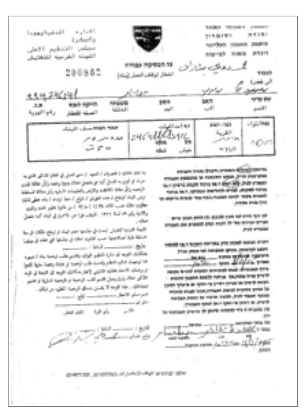
Stop work order by the sraeli occupation forces for a structure in al Hadidiya.

Al-Hadidiya and Um al-Kheir are also shaped by zoning and planning regulations Israel imposes in Area C through the ICA, which effectively forbids the construction of buildings and infrastructure. Not only does this serve as the legal pretext for home demolitions, but it also cements the isolation of these communities. Quite simply put, it is incredibly difficult to come and go. Public transportation does not reach these areas, meaning that one needs to rely on someone with a private vehicle or somehow coordinate a pickup on a main road. Winter rains turn the dirt roads into mud. One of our visits to al-Hadidiya had to be delayed a number of days, as even tractors were having a difficult time traversing the flooded