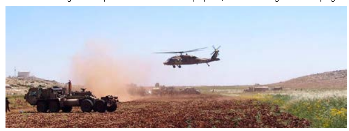
Israeli occupation forces use Palestinian fields in the Jordan Valley as training ground, May 4 2015.

settlement while maintaining and expanding territorial control.