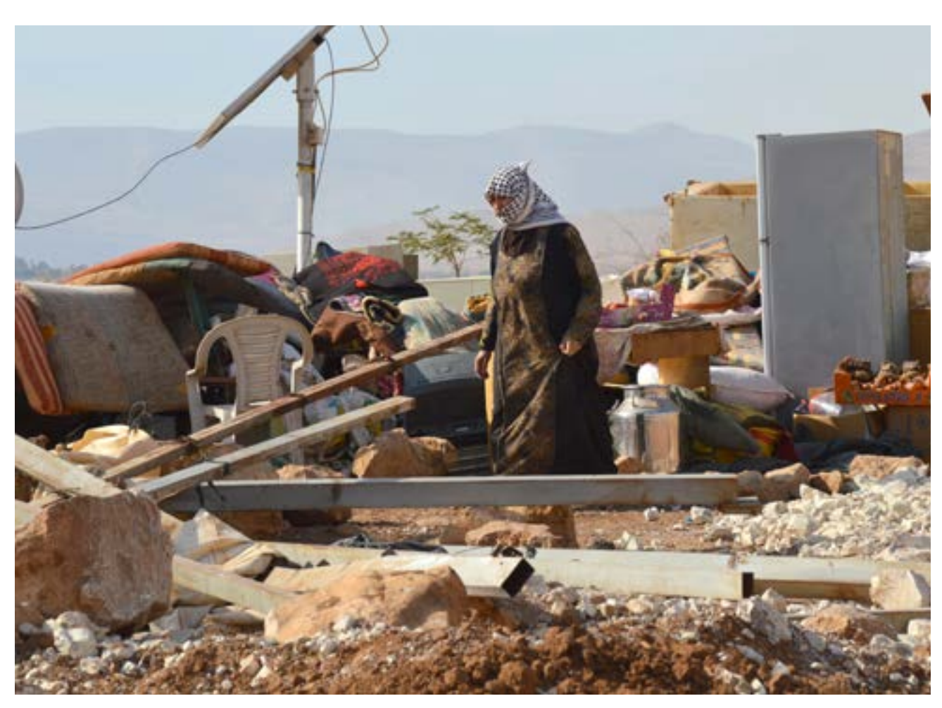
Al Hadidiya after the home demolitions in November 2015. All structures of the family had been demolished.

These Israeli policies of home demolitions and restrictions violate human rights and even the most essential obligations of international humanitarian law, including the duty to safeguard occupied territory on a temporary basis; to refrain from altering the area or exploiting its resources to benefit the occupying power; the prohibition of destruction of property not justified by military necessity; and to fulfill the basic needs of the local residents and respect their rights. Under the law of occupation, Israel is prohibited (unless necessary during military operations – which is not the case here) from destruction of civilian property of the occupied Palestinian territory. Extensive destruction of civilian property in an occupied territory is a prosecutable war crime and a grave breach of the Geneva Convention.