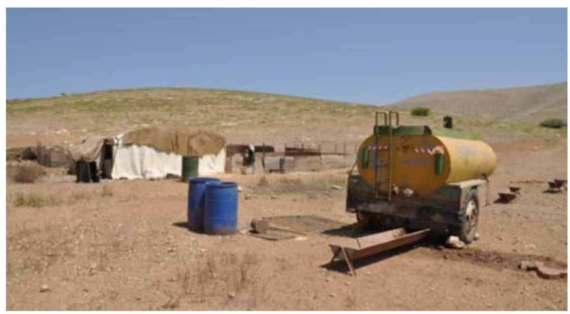
Palestinian water tanker providing al Hadidiya with water.

The compounded effects of these policies has impacted Palestinians lives in two key ways. First, as core areas of the settler project expand in the Jordan Valley and the south Hebron hills, it transforms these areas into peripheral zones for the Palestinian West Bank. Rather than a natural geographical description, the isolation, disrepair and neglect of these small communities is a direct result of Israeli settler colonialism. Second, not only does this process decrease the total amount of land available to Palestinians, but it transforms the ways in which they are able survive and resist on the land. In the case of herding communities, life is becoming impossible to sustain.